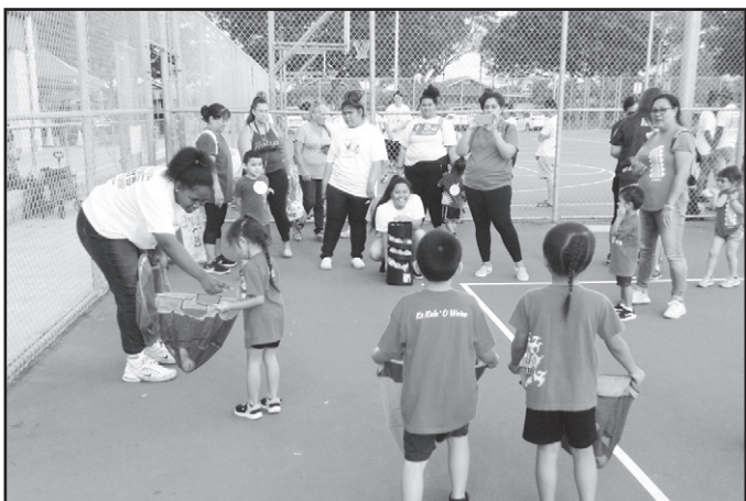
Waipahu High School - Teacher Education Pathway, Special Olympics sponsored by "Play Day."