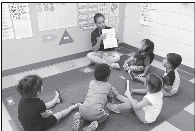
Waipahu High School - Teacher Education Pathway, SS Mabini lesson.