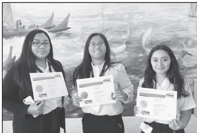
Leilehua High School - Teacher Education Program, FCCLA Star Events at the Hawaii Convention Center.